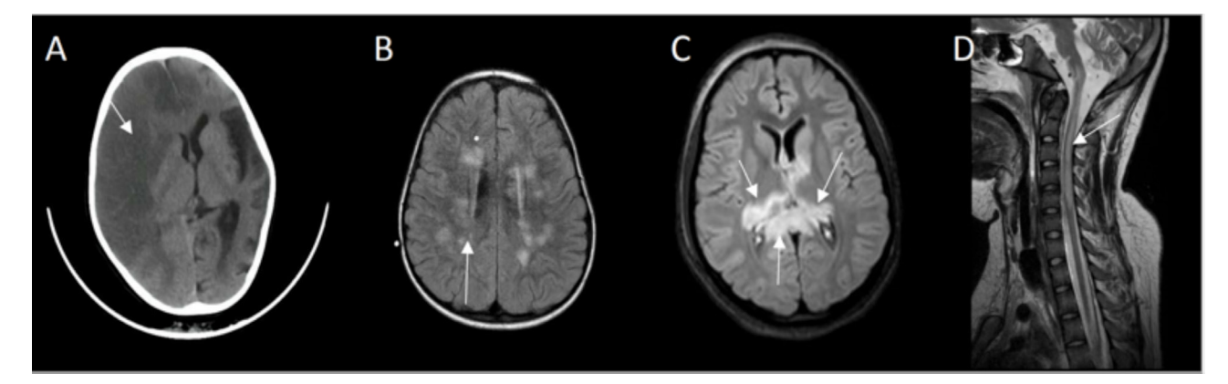
Figure 2 - CT brain showing A) Case 7: right hemispheric loss of gray-white matter interface and effacement of sulci affecting right anterior and middle cerebral artery territory, midline shift and left hemispheric cortical atrophy. B) Case 6: FLAIR MRI depicting multiple high signal intensity lesions in centrum semiovale and periventricular white matter. C) Case 4: FLAIR MRI revealed bilateral asymmetrical high signal intensities of the thalami and splenium of corpus callosum. D) Case 1: T2 MRI midline sagittal showing high signal intensity extending from medulla oblongata up to C5 of cervical cord.